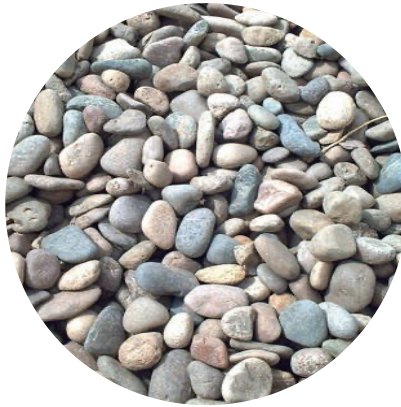
INORGANIC - 3" RIVER ROCK