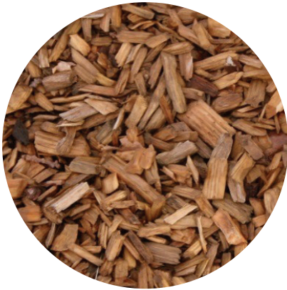
ORGANIC - GOLDEN SMALL CHIP